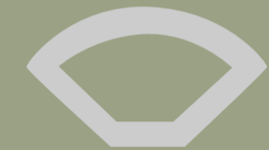
Quarter round 2400x28x16mm Cuarto de circunferencia 2400x28x16mm